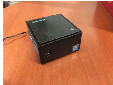
FIGURE 1 vCPE

In the Smart Application and Virtual Infrastructure (SAVI) project, we envision the cloud to have a three-tiers infrastructure. Tier 1 has core data centers that are traditional data centers discussed above. Tier 2 has Smart Edges that are agile data centers residing closer to end users. In addition to the traditional compute, network and storage resources, Smart Edges also provide other heterogeneous resources such as programmable hardware (FPGA), GPUs, Software Defined Radio (SDR), and wireless access point. The Smart Edge is mainly to deliver quality applications that require high responsiveness and have requirements that can only be satisfied with a heterogeneous data center close to the end users [1]. Finally Tier 3 has sensors and virtualized Customer Premises